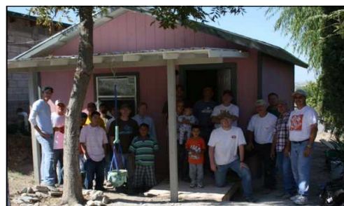
Another great job from Harris Creek Baptist Church!

We are very grateful for your continued support for the heart of our ministry - feeding God's children!! Please consider whether you could help us to erase our recent deficit and to catch back up on meeting our program costs for the entire year.