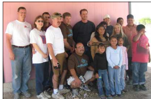
The FBC Burleson team and their family!