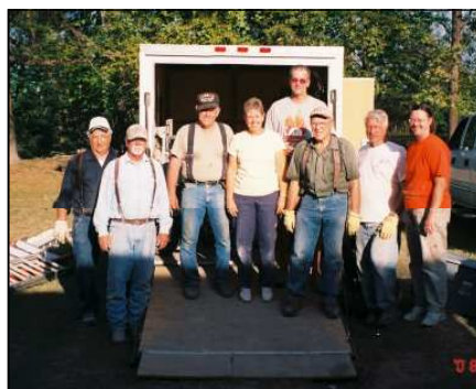
The FBC Clifton crew!