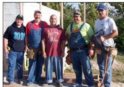
The team at the Cedar Shores Baptist Church house - working!