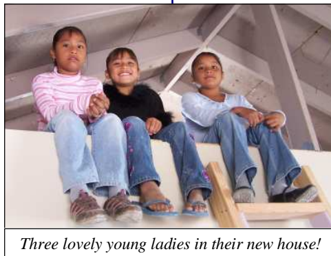
Three lovely young ladies in their new house!

Thank you for being on the front line. I pray God's every blessing on you for your support of Grace of Giving!